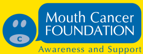
Mouth Cancer Foundation