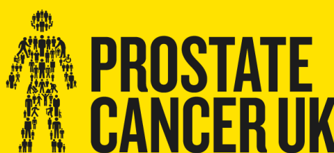
Prostate Cancer UK