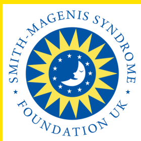
Smith-Magenis Syndrome Foundation UK