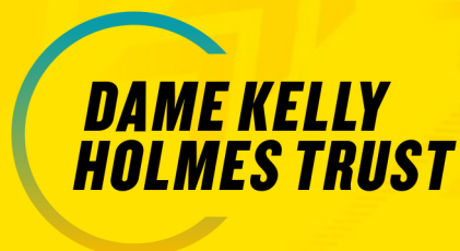
Dame Kelly Holmes Trust