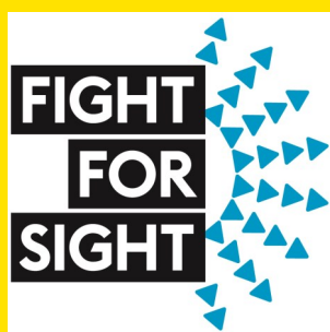
Fight for Sight