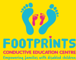
Footprints Conductive Education Centre