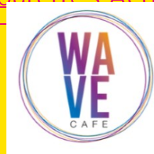
Wave Muswell Hill CIO