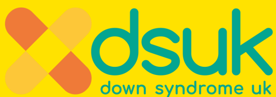
Down Syndrome UK