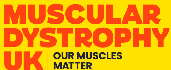
Muscular Dystrophy UK