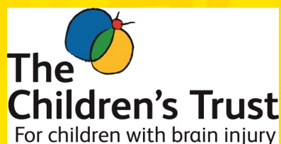
The Children's Trust