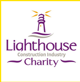
Lighthouse Construction Industry Charity