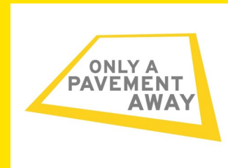
Only A Pavement Away

PARKINSON'S UK CHANGE ATTITUDES. FIND A CURE. JOIN US.