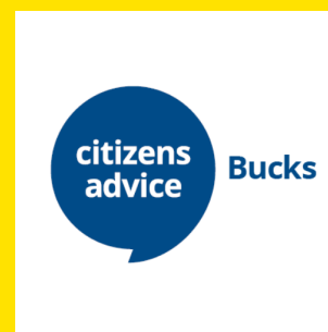
Citizens Advice Bucks