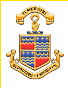
The Harvey Academy