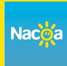
Nacoa - National Association for Children of Alcoholics