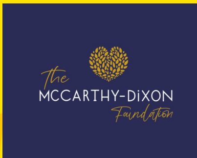
The McCarthy-Dixon Foundation