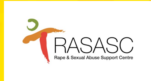
Rape & Sexual Abuse Support Centre, Guildford (RASASC)