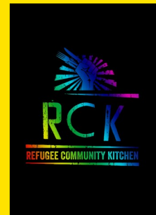
Refugee community kitchen