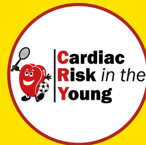
Cardiac Risk in the Young