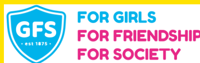
Girls Friendly Society