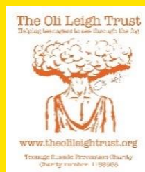
The Oli leigh Trust