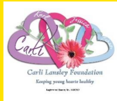
Carli Lansley Foundation