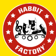
The Habbit Factory