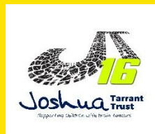
Joshua Tarrant Trust