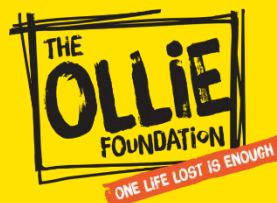
The OLLIE Foundation