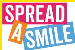
Spread a Smile