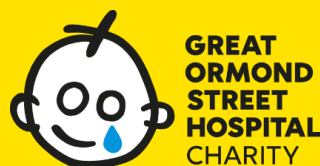
Great Ormond Street Hospital Children's Charity