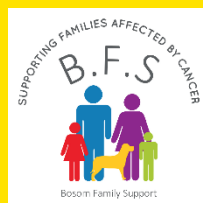
Bosom Family Support (BFS)