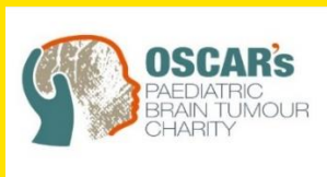
Oscar's Paediatric Brain Tumour Charity