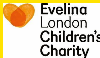
Evelina Children's Charity