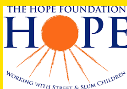
The Hope Foundation For Street Children