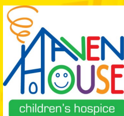
Haven House Children's Hospice