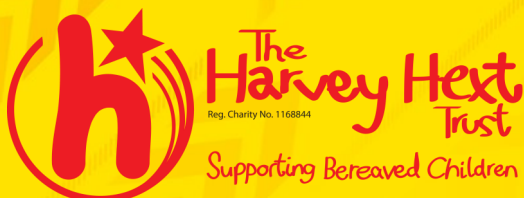
The Harvey Hext Trust