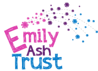
Emily Ash Trust

Emily's Star www.emilysstar.co.uk Registered Charity no: 1152520