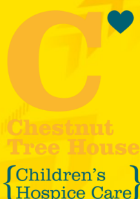
Chestnut Tree House