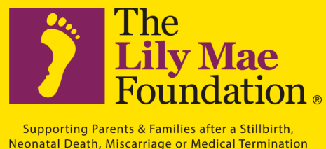
The Lily Mae Foundation