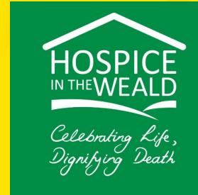
Hospice in the Weald