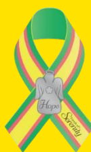
Friends of Serenity