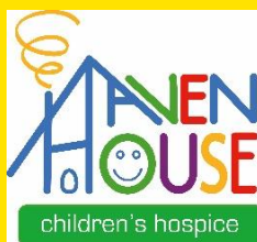
Haven House Children's Hospice