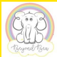
Beyond Bea Charity