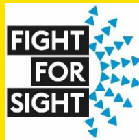
Fight for Sight