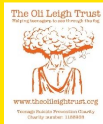
The Oli leigh Trust