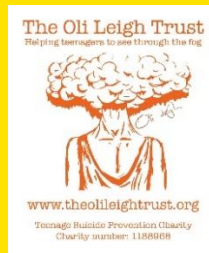
The Oli leigh Trust