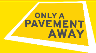
Only A Pavement Away