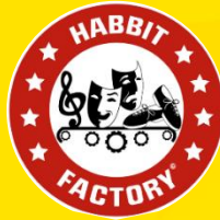
The Habbit Factory