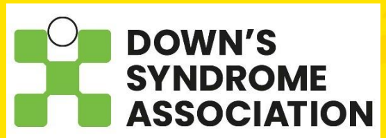
Down's Syndrome Association