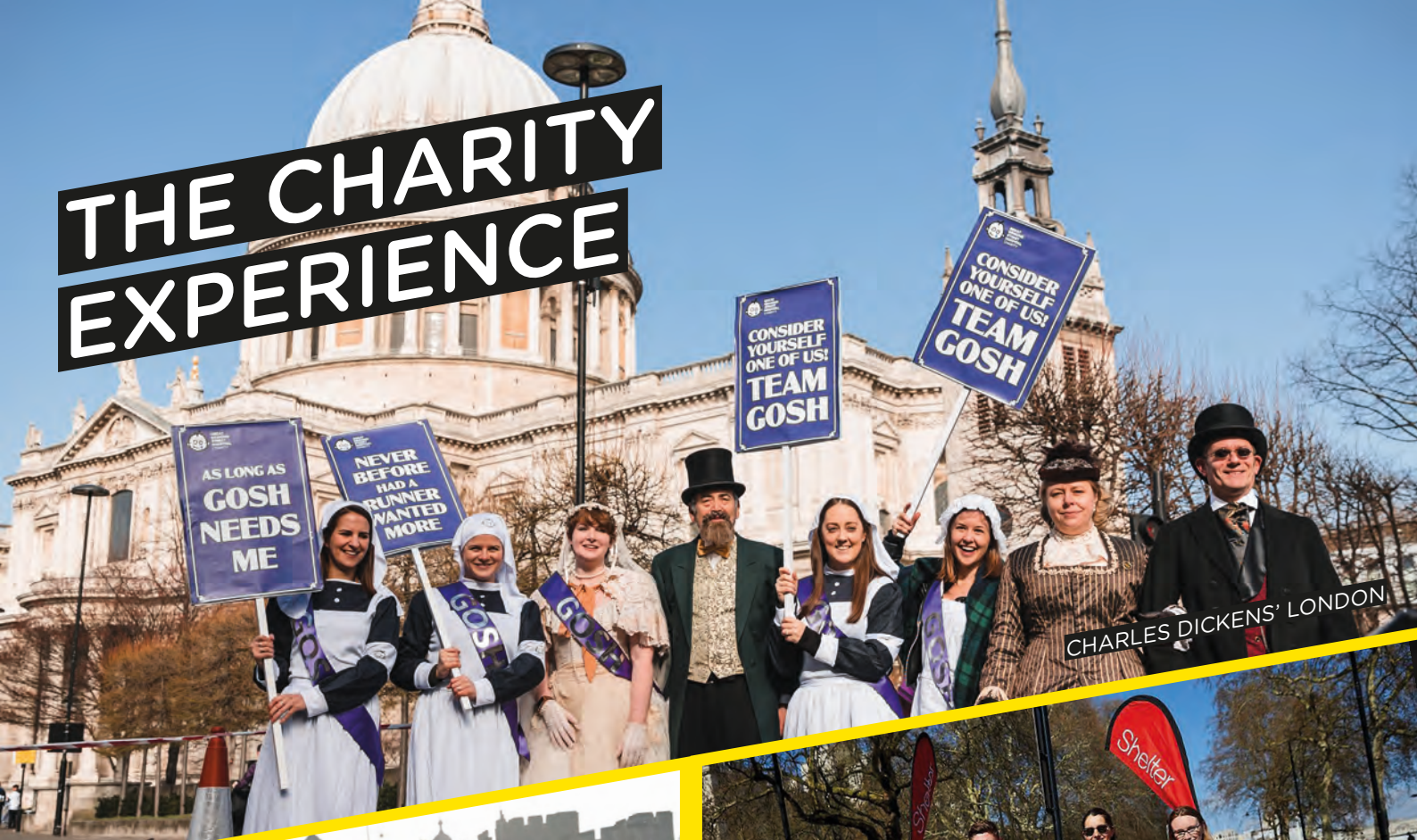
CHARLES DICKENS' LONDON