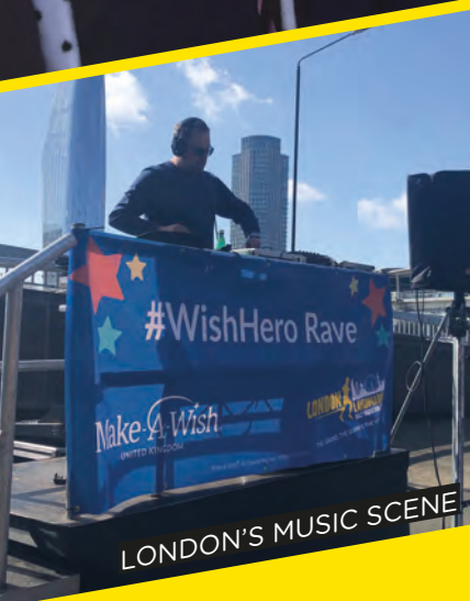
LONDON'S MUSIC SCENE