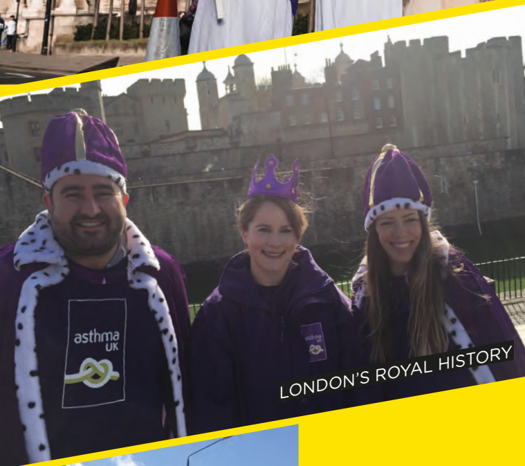
LONDON'S ROYAL HISTORY